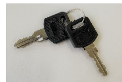
Keys x 2