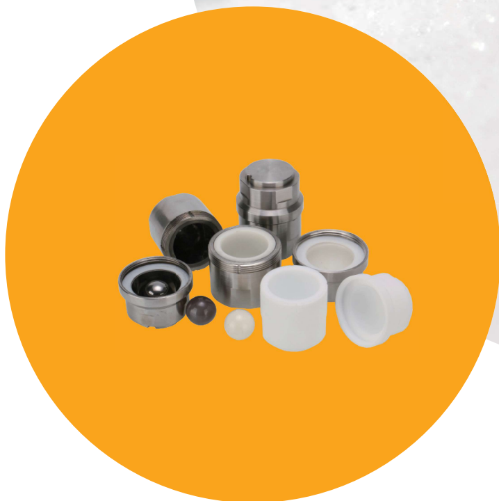
Micro Ball Mill GT300