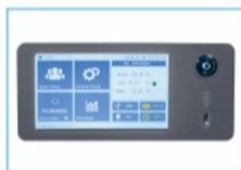
LCD touch screen