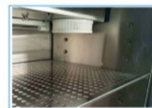
HEPA filter (for water jacket)