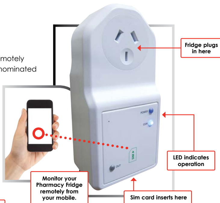
Temperature Monitoring Display

NOTE: Requires a GSM sim card; SMS charge not included with device.