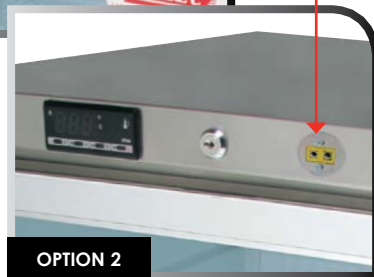
Temperature Monitoring External Sensor