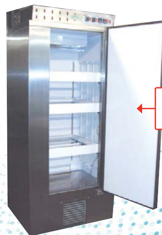
Model ICC50-SL\WL Single door with wall and shelf lighting.

Serving the Scientific, Medical and Research industries since 1945