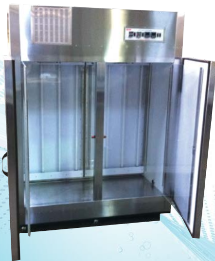
Model ICC120 With rear wall lights and white interior.