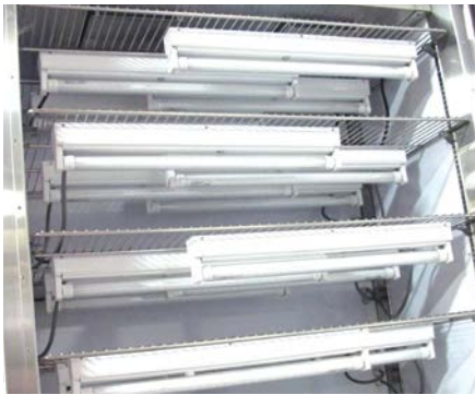
Incubator with optional shelf lighting.

When optioned the controller can be connected via RS232/RS485 communication ports which can be connected directly to a data logger or computer to log chamber information. Software is available for programming and monitoring.