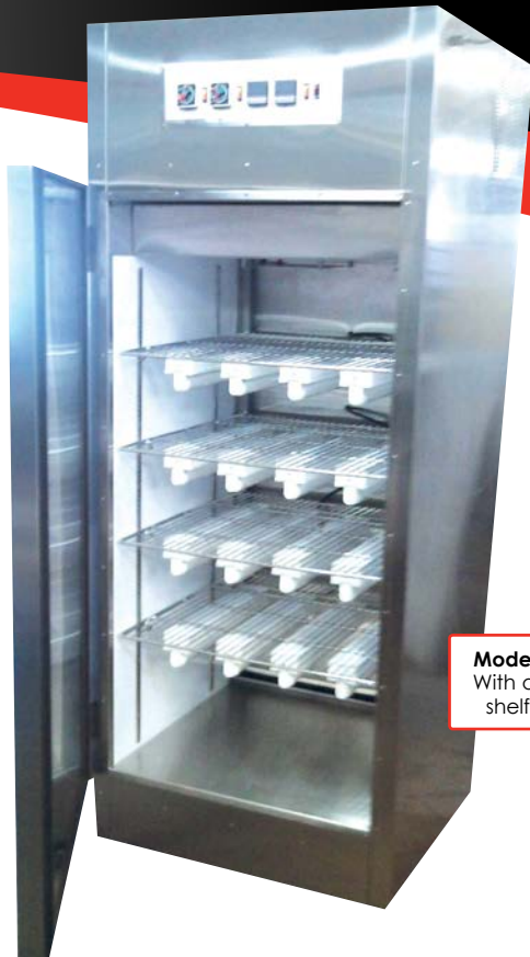
Model ICC50 With optional shelf lights.