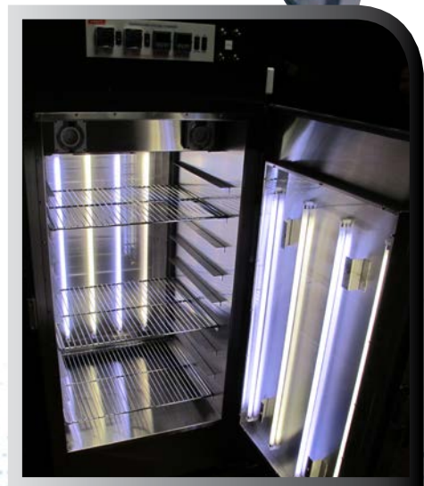
Incubator with a mixture of T5 Aquastar and Marinestar light banks.

Serving the Scientific, Medical and Research industries since 1945