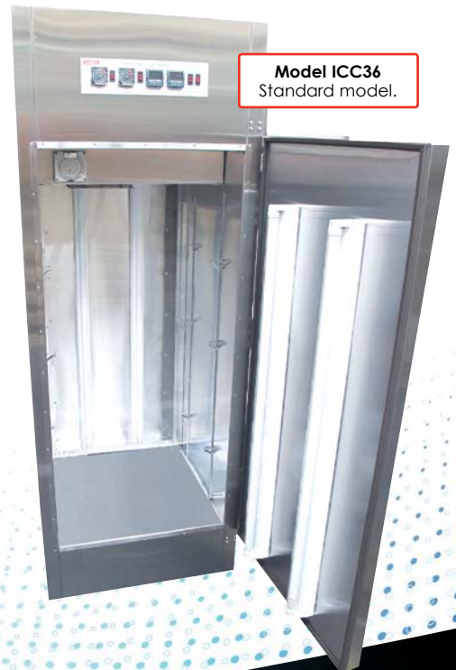
Model ICC36 Standard model.

Controller – With Labec Refrigerated Cycling Incubators, environmental conditions can be accurately reproduced and controlled with our dynamic air flow system and unique heating system. They provide excellent temperature uniformity using a digital microprocessor based PID temperature controller which controls the temperature within the range 5°C Lights OFF / 10°C Lights ON up to +50°C and Day/Night simulation features.