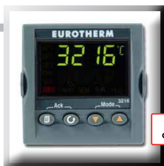
PID Control display system

Controller – A digital display temperature controller controls the temperature within the range ambient +5°C to 100°C.